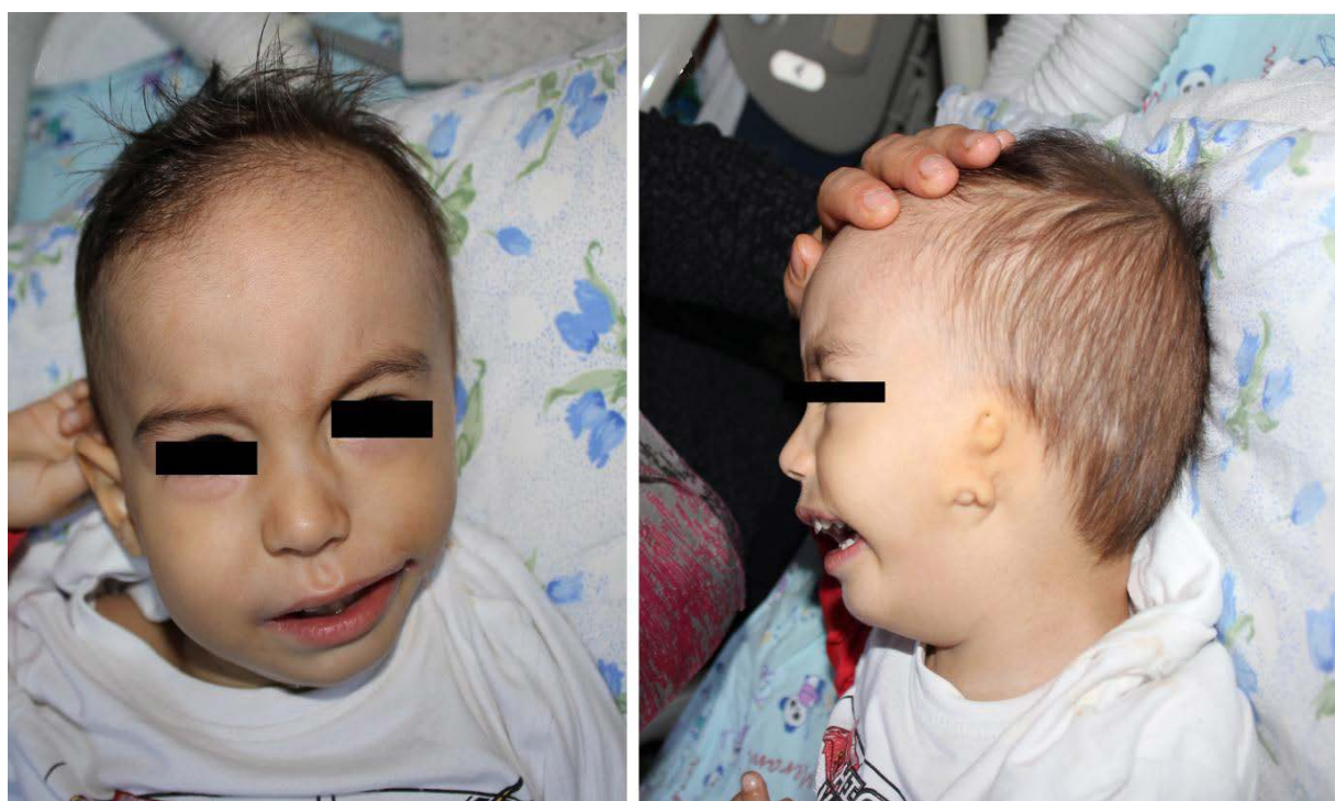
Figure 3: Clinical aspects of the case 3.