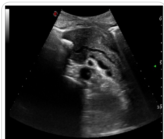
Figure 2: Ultrasound evaluation of the patient's pancreas 8 months after clinical onset of disease before administration of i.v. contrast.

a creatinine clearance of 77 ml/min. The patient was stabilized and weight gain was obtained by introducing oral pancreatic enzyme supplementation with pancrelipase 150 mg b.i.d. (10.000 units of lipase, 8000 units of amylase and 600 units of protease per tablet). Based on clinical, immunological and biochemical parameters the diagnosis of chronic lupus-associated pancreatitis was made and the patient was discharged on low-dose methylprednisolone.