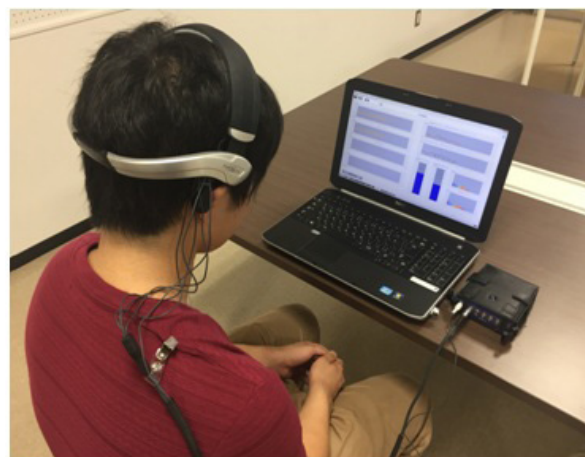
Figure 1: The auditory neurofeedback training device used in this study.

EEG data, and real-time auditory feedback, which includes the degree of event-related desynchronization of mu rhythm (8-13Hz) related to the motor imagery [21], was provided to the participant. Specifically, when mu-event relation desynchronization (ERD) appeared during the motor imagery task, it meant that the motor imagery performed by the participant was good and an auditory stimulation was provided to the participant at that time. On the other hand, when mu-ERD did not appear, an auditory stimulation was not provided to the participant. For the auditory stimulation, a pleasant sound specified by the International Affective Digitized Sounds [22] was used. Using auditory neurofeedback, the participant was able to properly perceive the quality of the motor imagery performed.