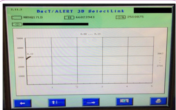
Figure 3: The graph of false positive blood culture.