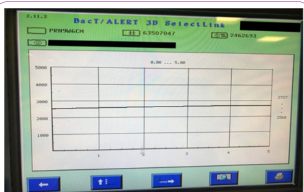
Figure 2: The graph of negative blood culture.